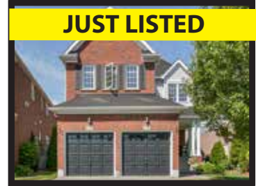
73 Lafayette Blvd $779,900 4+1 Bedroom Finished Basement