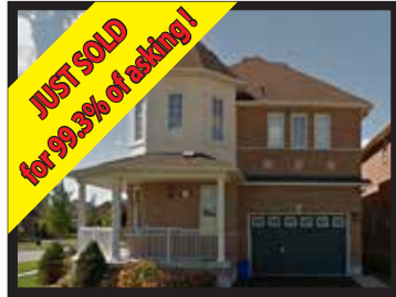
123 Rich Crescent