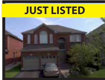
75 Medland Ave $859,900 4 Bedroom, 3 Bath 2800 SF 9' Ceilings